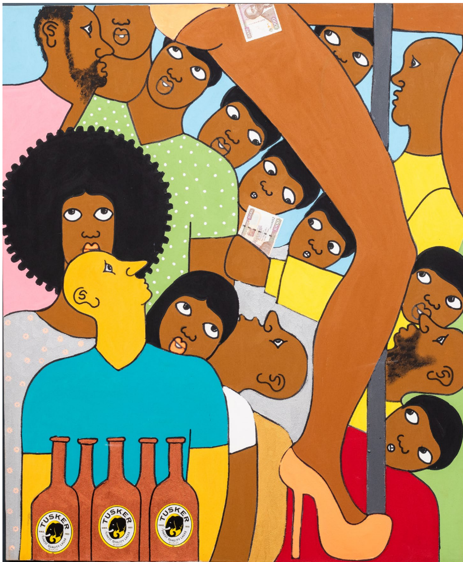
The Sight acrylic on canvas