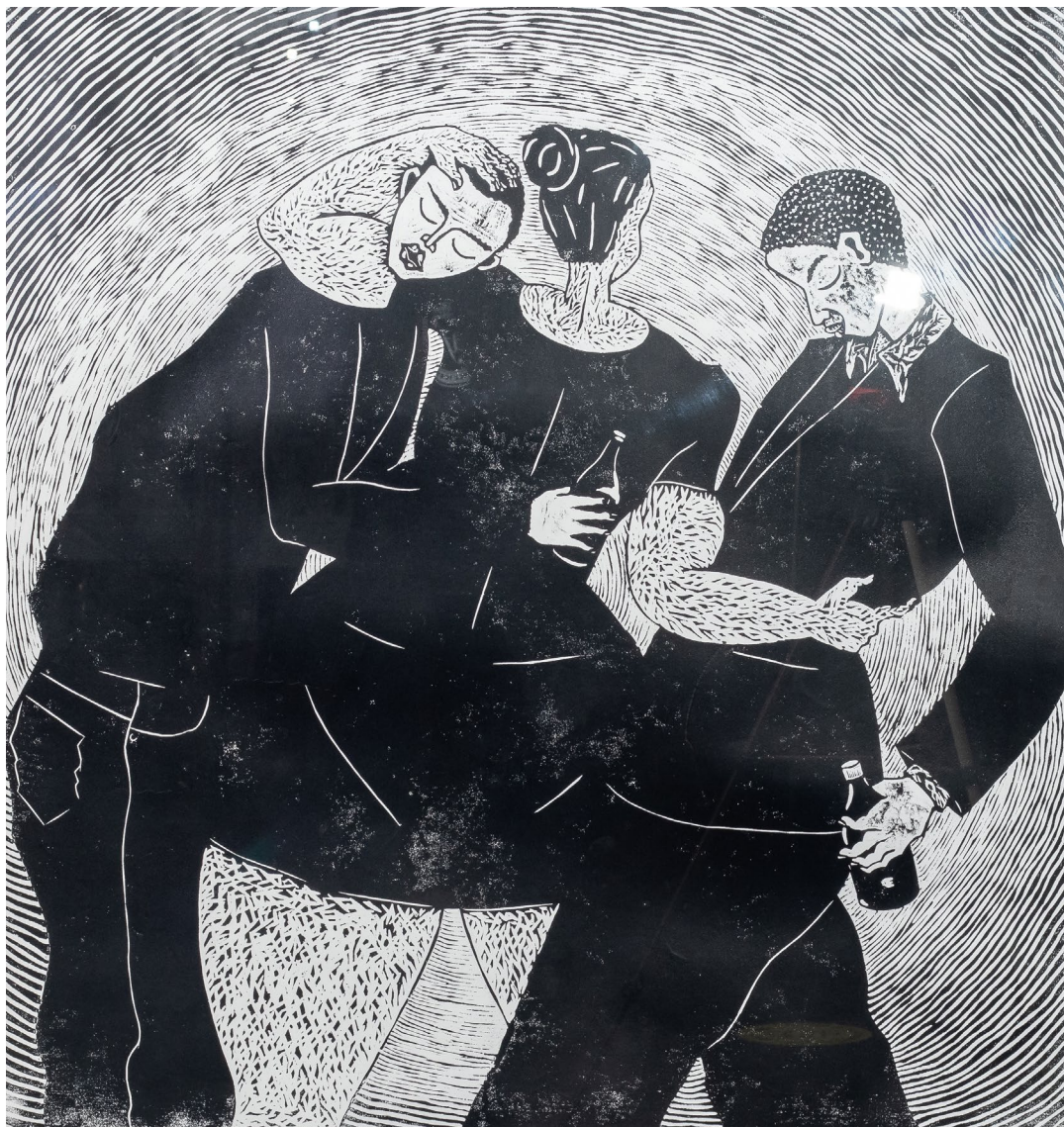
Untitled woodcut print on paper