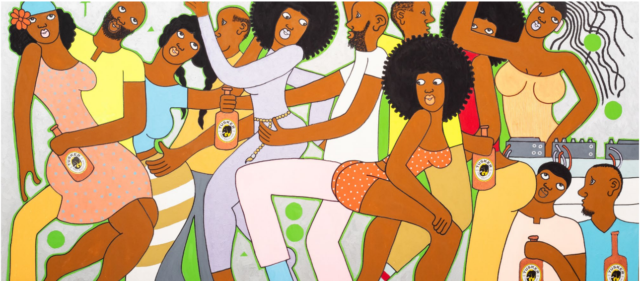
Twerk acrylic on canvas