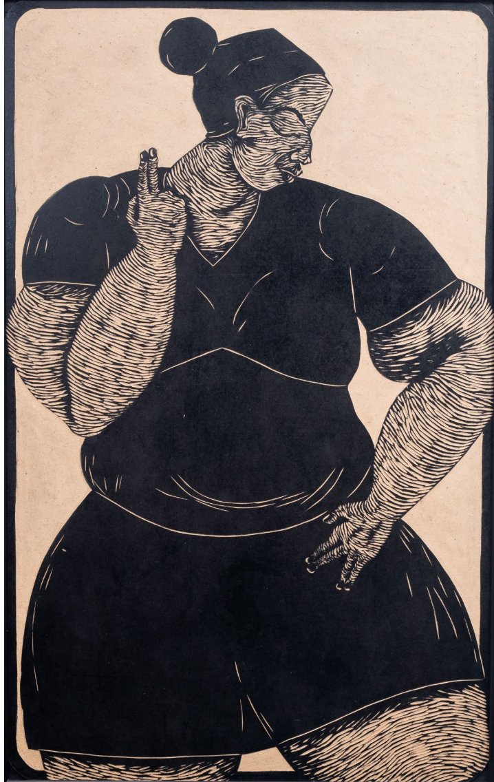
Untitled | Monica II