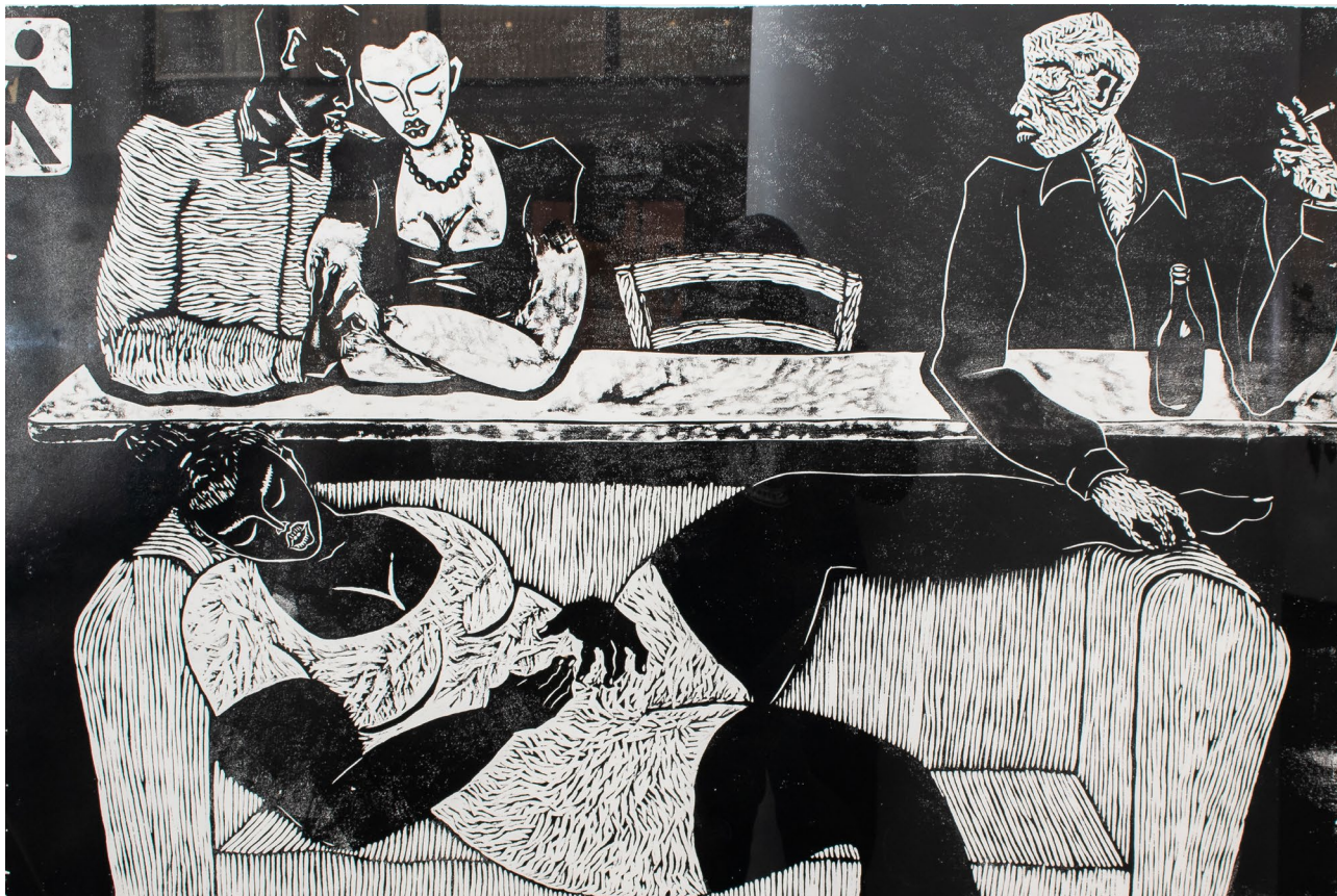
Untitled | Ten woodcut print on paper